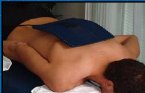
Lumbar - Pre-treat for 9 minutes with the unattended XP Light Pad (7,500mW).