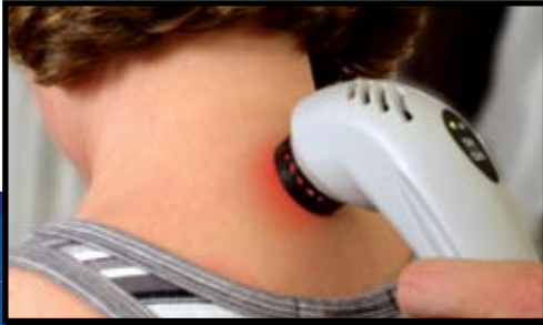
Cervical - Pre-treat each spot for 30 seconds with the D881 Light Probe (1,000mW).